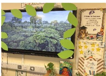
Yr4 – Reading Café