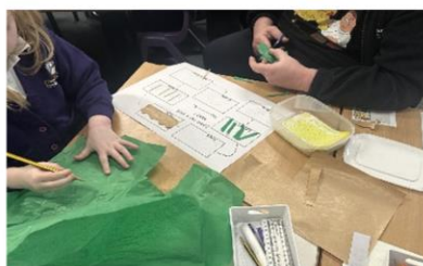
Yr2 – Going on a bear Hunt Café