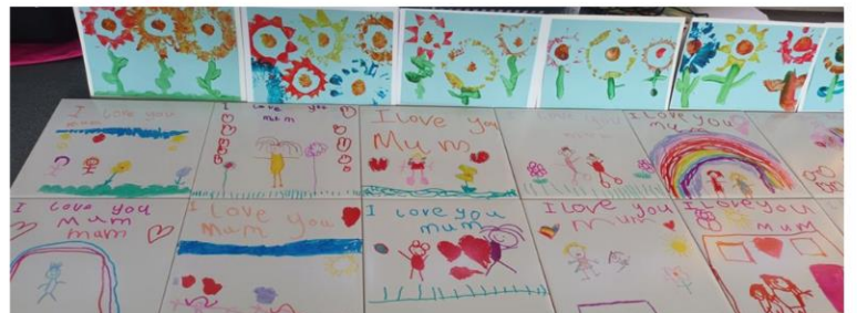
YrR – Making Mother’s Day Gifts