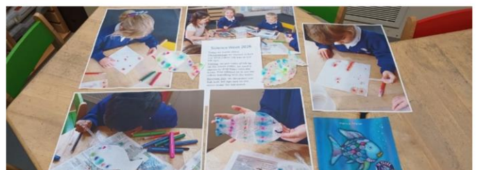
YrR – Science Day! Chromatology of Rainbow Fish